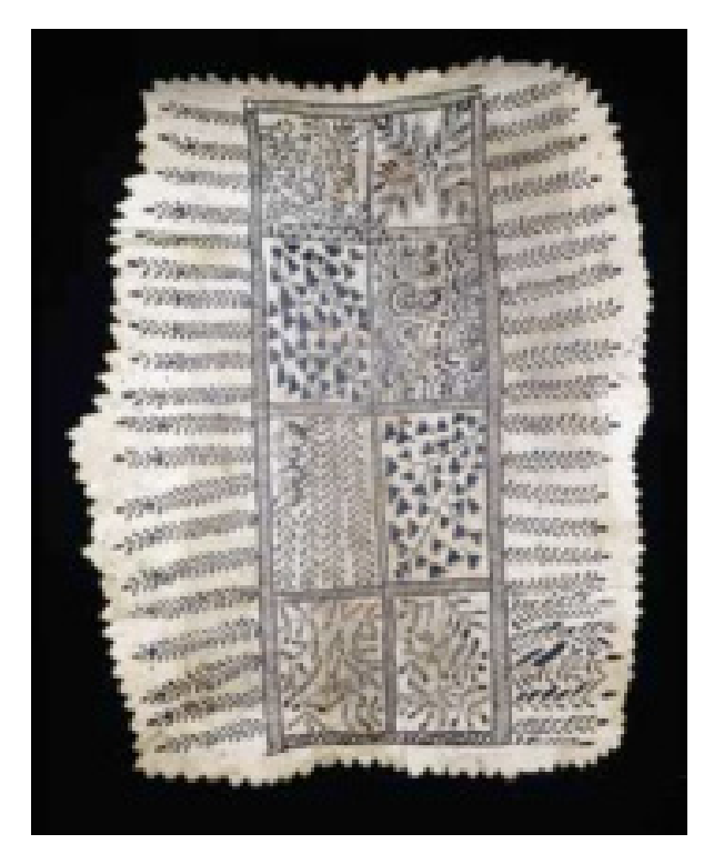
Figure 3: Polynesian tapa cloth

In his book Studies of Tectonic Culture, Kenneth Frampton refers to these two basic modes of building, the compressive mass and the tensile frame in vernacular architecture, as intrinsically tied to spatio-temporal rhythms and a non-Western nonlinear attitude toward time. He refers to a time when space was not an integral part of our thinking about architecture and seeks to 'mediate and enrich the priority given to space by a reconsideration of the constructional and structural modes' by which architectural form must be achieved. Frampton is less interested in constructional techniques than in